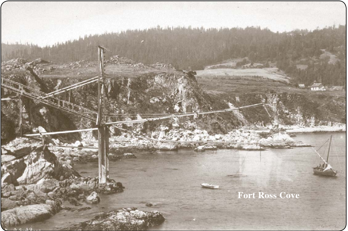
Fort Ross Cove