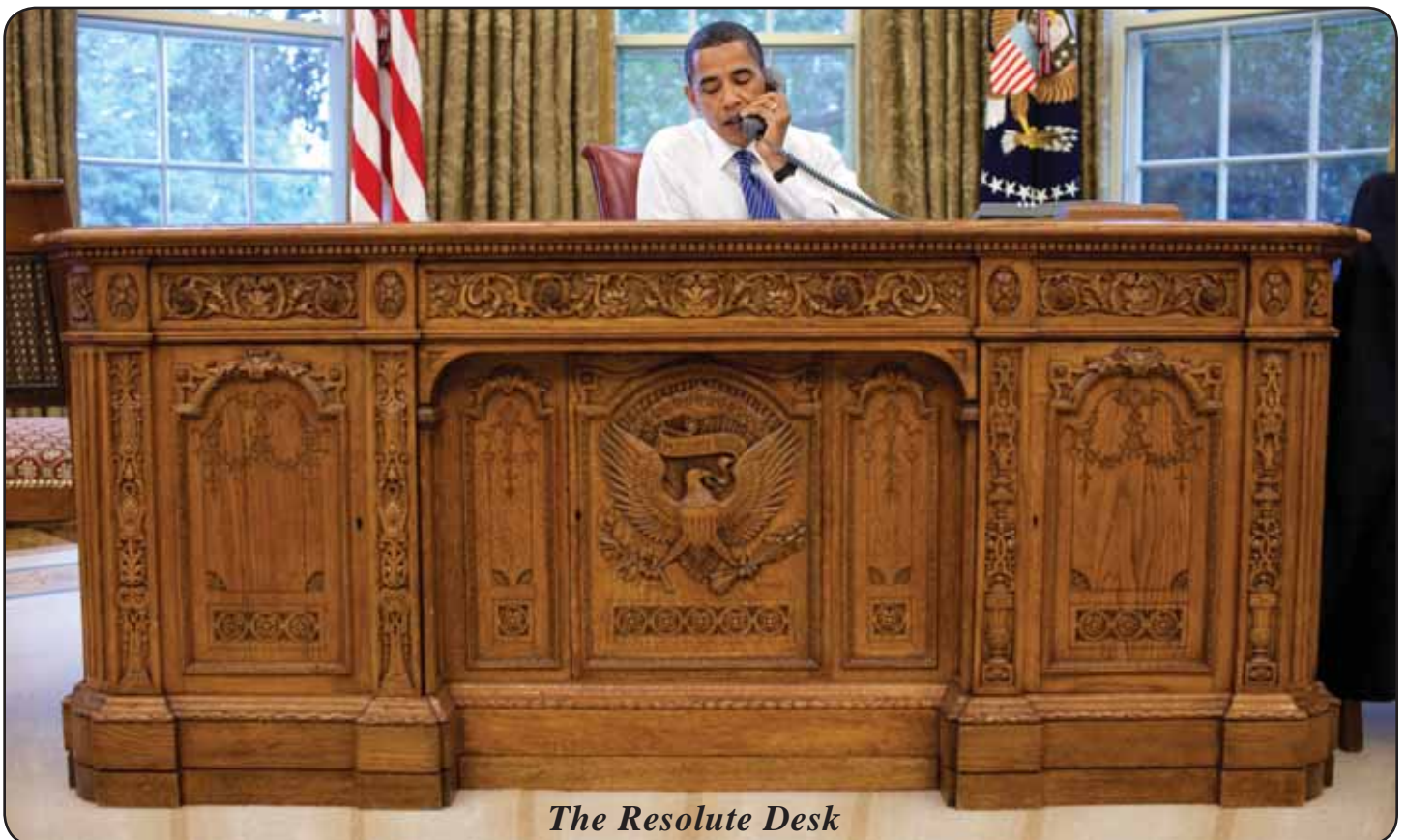
The Resolute Desk